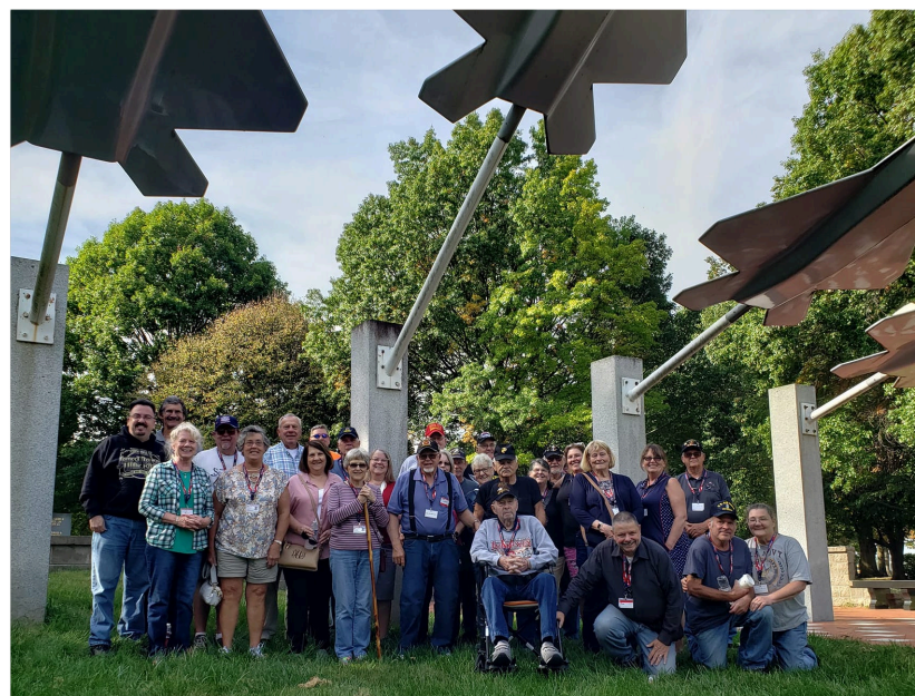
Huron County veterans and their spouses pose outside of the National Museum of the U.S. Air Force in Dayton. Thirty-one people attended the overnight trip in mid-September.