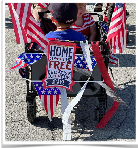
The message on this decorated wagon in the 2023 Memorial Day parade in Monroeville says it all.

“Growing up in Monroeville, I remember working hard the night before Memorial Day decorating our bicycles and looking forward to being in the Memorial Day parade. Next came the Boy Scouts.